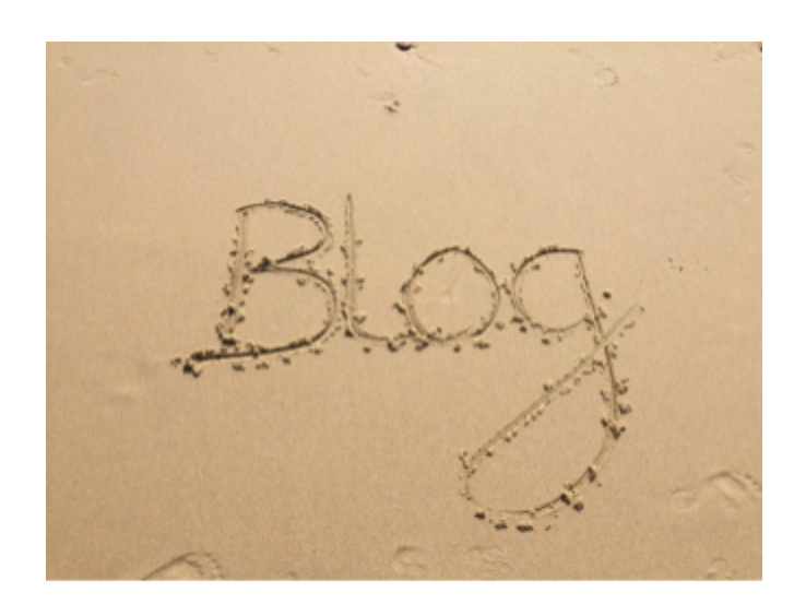
Blog your way to online writing freedom

Your earnings potential depends on a few factors, but you can expect to make anywhere from $150 - $800 per post. The average length is around 1,000 words but can range anywhere from 800 - 2500 words. The number of blog posts depends on the clients' marketing plan. As with emails, these are rarely one time projects.