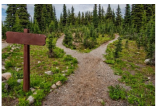
Choose your path to online writing freedom

I'm living the dream I had not too long ago while daydreaming during those boring corporate meetings.