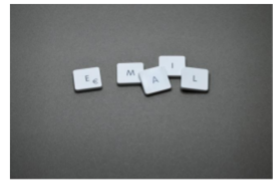
Emails still offer the best ROI for businesses and a great path to online writing freedom for freelancers.

There are several reasons companies hire freelance copywriters for email projects;